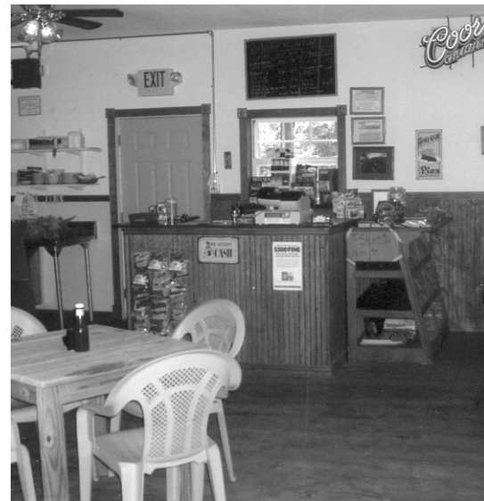
Named one of the "Top 3 Burgers in Texas" by Texas Monthly Magazine